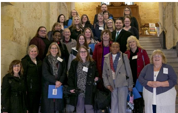
Great turnout at the Day at the Indiana Statehouse!

Lastly, the group toured the Statehouse and learned about the rich history of our state legislative system.