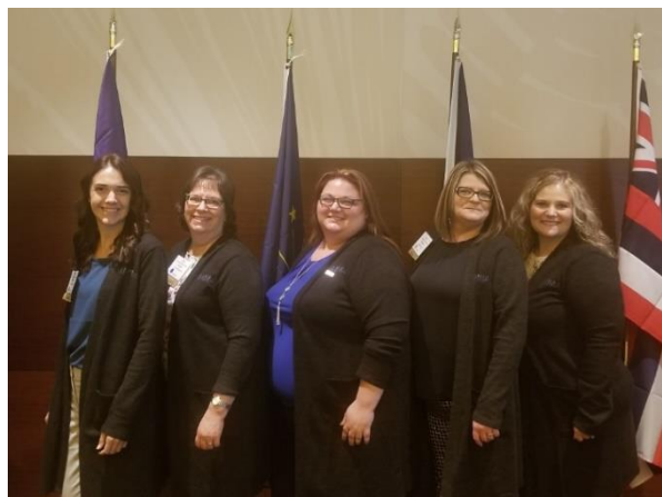
Indiana Delegates at the House of Delegates Meeting in Chicago, IL on Sunday, September 15, 2019.

Finally, we are excited to announce the opening for Annual Meeting Registration and Sponsorships on October 1! We cannot wait to share with you the speakers and the changes we have made for this year. The one thing that is not changing is that we will AGAIN be at the Embassy Suites Conference Center, Noblesville IN. Yes, you will have plenty of parking, you will have plenty of space in the meeting rooms, and better yet, you will have free WIFI during the meeting! Speakers will start being announced November 1. So, stay tuned! Watch the IHIMA website for the opening of registration, vendor booth options, and sponsorships (with website advertising) opportunities! #IHIMA20